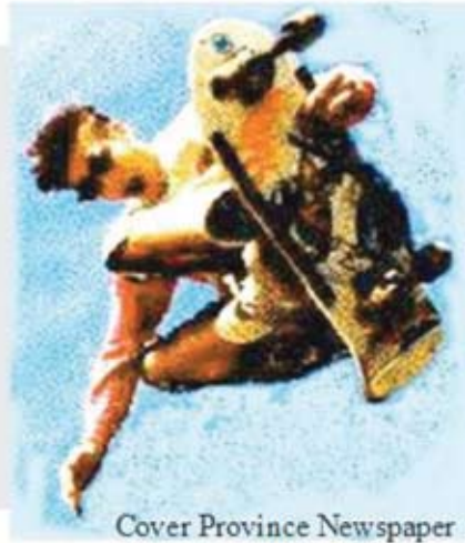
Cover Province Newspaper