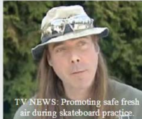
TV NEWS: Promoting safe fresh air during skateboard practice.