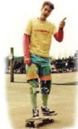
Ranchstyle Skateboard Contest Granville Island Waterpark