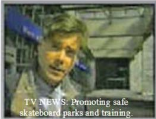
TV NEWS: Promoting safe skateboard parks and training.