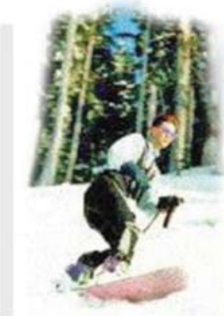
Camera man for Canada's first snowboard video.